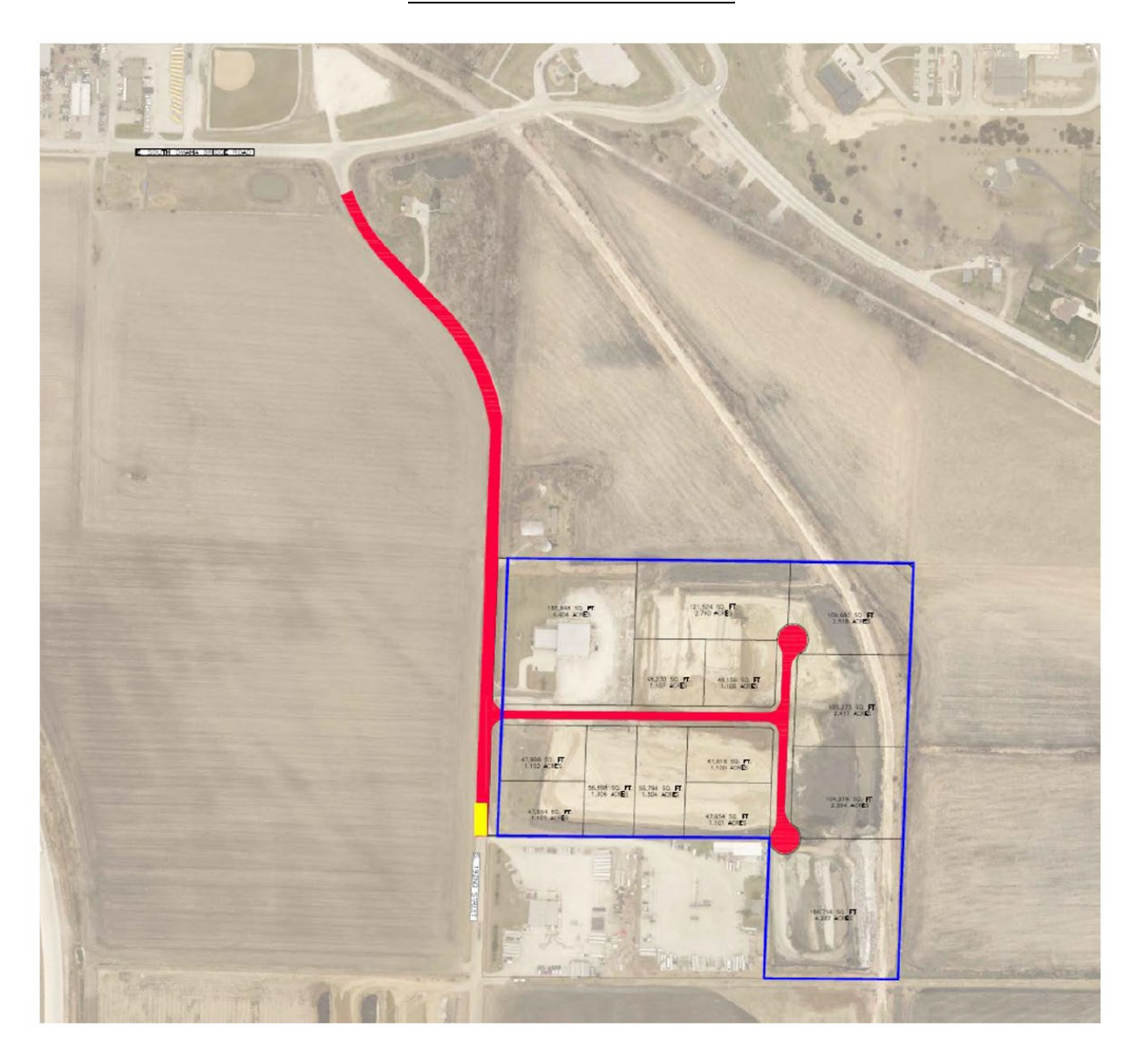
EXHIBIT B-1 PUBLIC IMPROVEMENTS