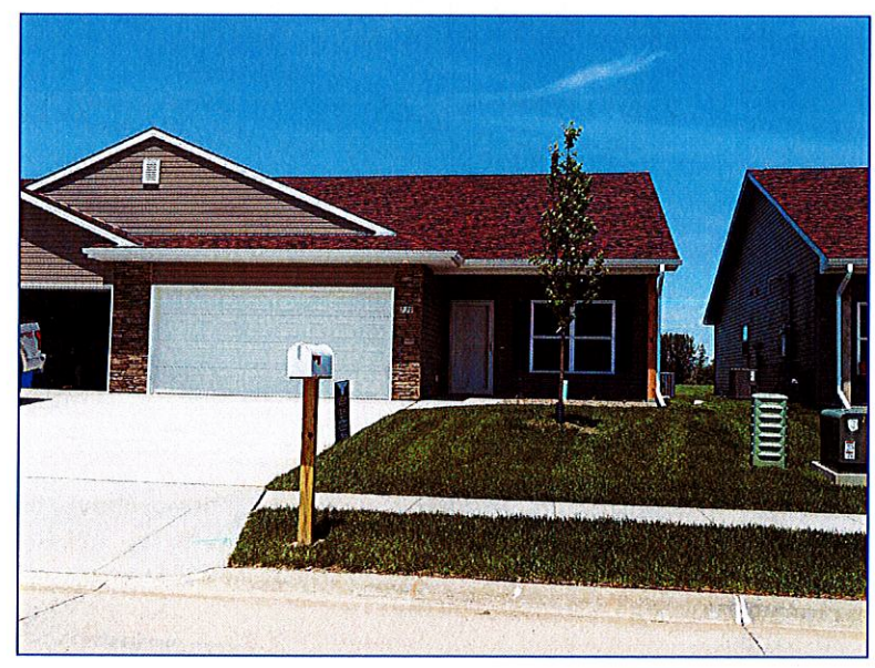
130 WALLACE AVE, ONEILL, DIANE L, 1 06/01/2020