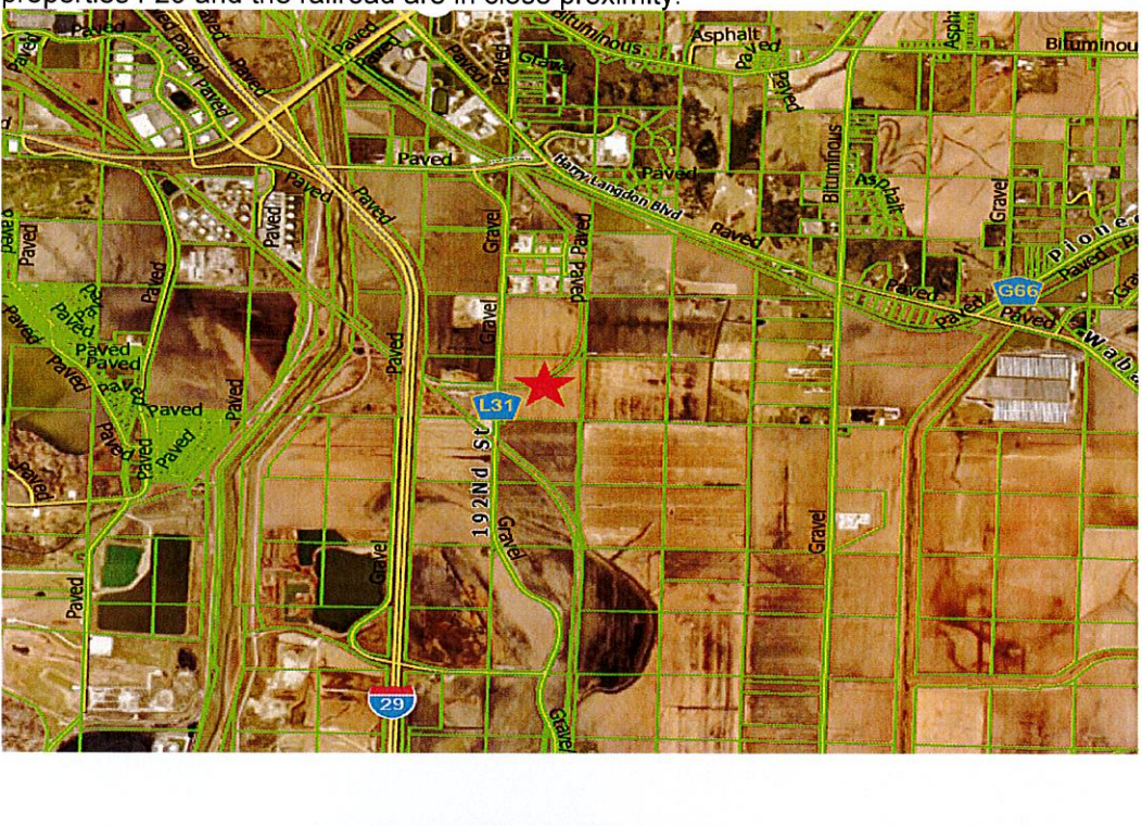
SITE & AREA REVIEW: The properties in the immediate area are a mixture of agricultural ground and industrial properties I-29 and the railroad are in close proximity.