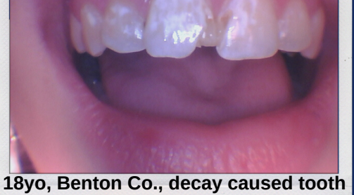
Byo, Benton Co., decay caused tooth to break.

won't have front teeth until she is about 7.