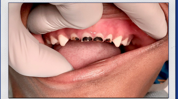
4yo, Fort Dodge, with decay. 12 crowns and 8 root canals in OR