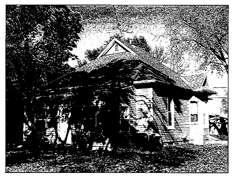
1822 4TH AVE, STEFFES, BRANDEE, 1 11/10/2016